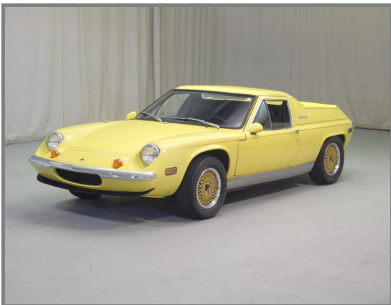
1974 Lotus Europa